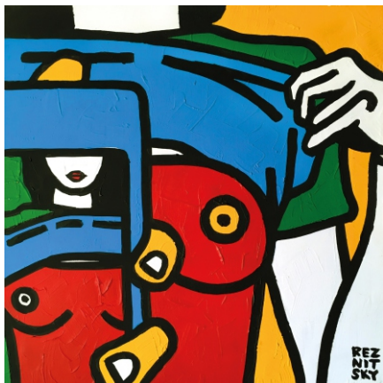
Mini "B-size" 50 x 50 cm Acrylic on canvas