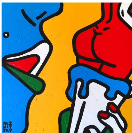
Mini "Strawberry" 50 x 50 cm Acrylic on canvas