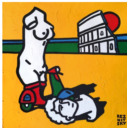
Mini "ITALY" 50 x 50 cm Acrylic on canvas