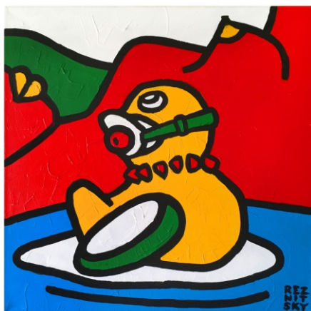
Mini "Ducktales" 50 x 50 cm Acrylic on canvas