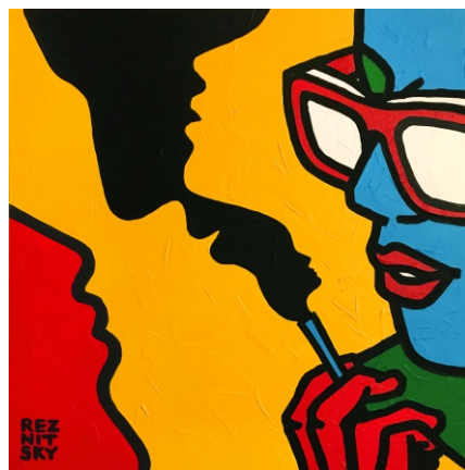
Mini "Bla Bla Bla" 50 x 50 cm Acrylic on canvas