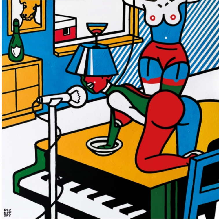
The lady with the dog, 2019 Acrylic on canvas 150 × 150 cm