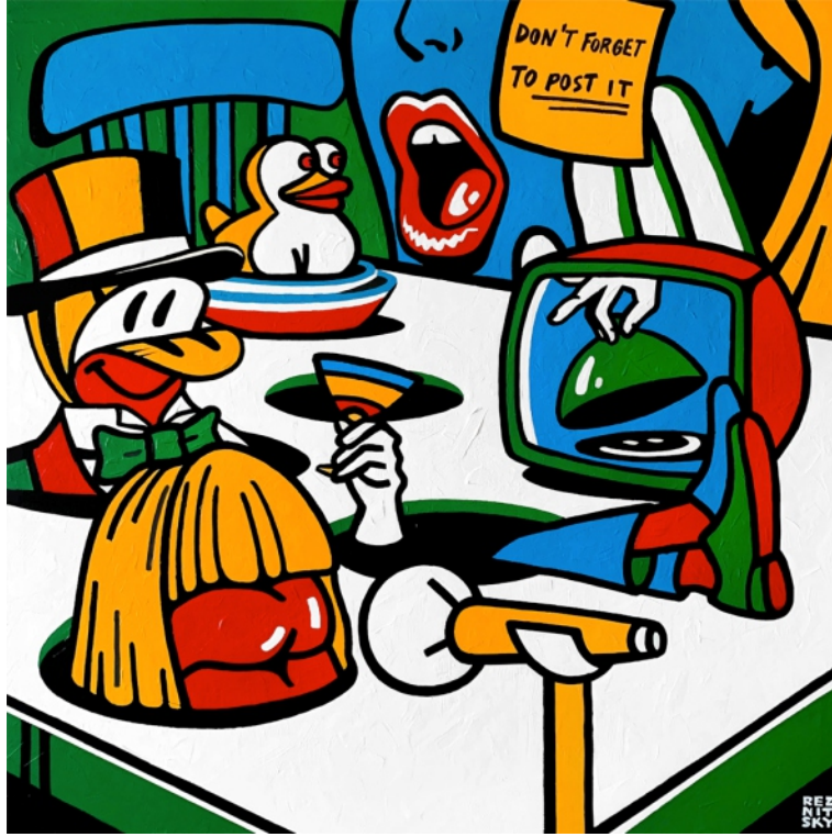
The Discreet Charm of the Bourgeoisie, 2023 Acrylic on canvas 120 × 120 cm