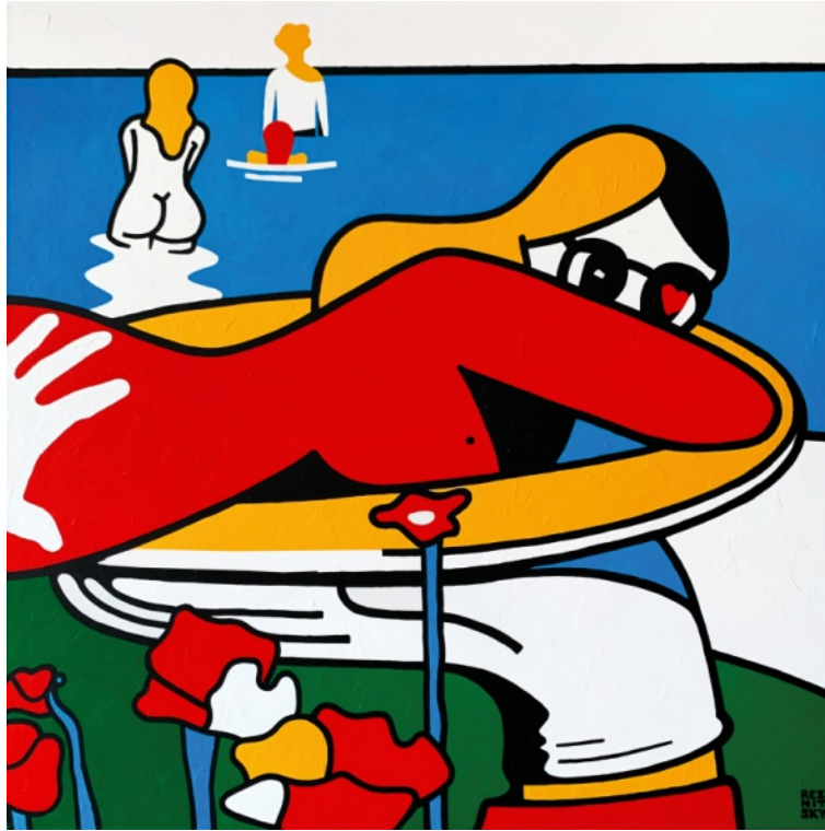
Breakfast on the Grass, 2022 Acrylic on canvas 150 × 150 cm