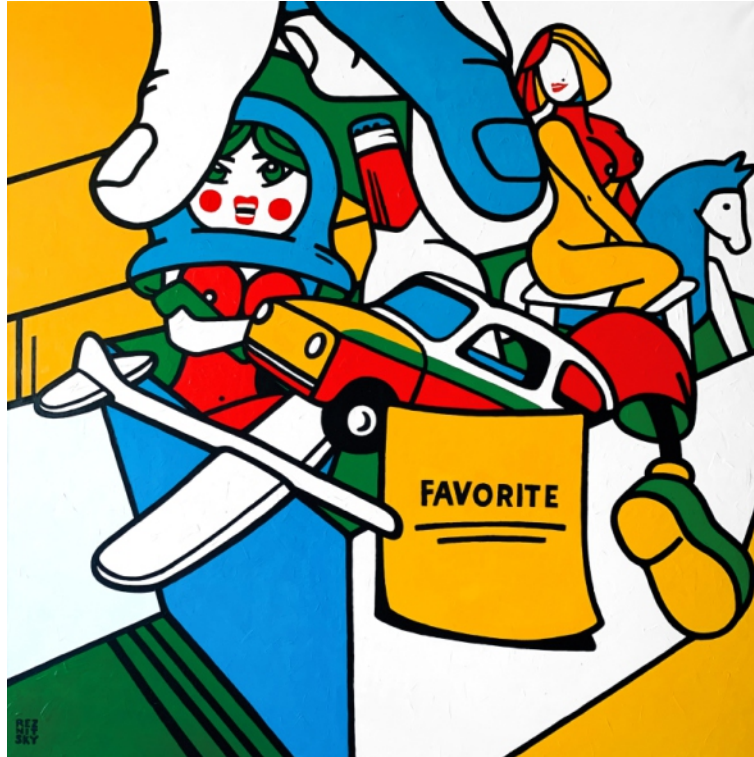
Favorite, 2022 Acrylic on canvas 150 × 150 cm