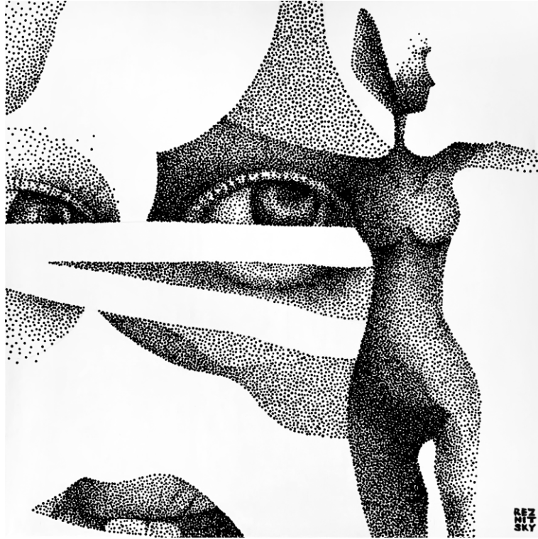
DOT ART 2, 2022 Acrylic on canvas 150 × 150 cm