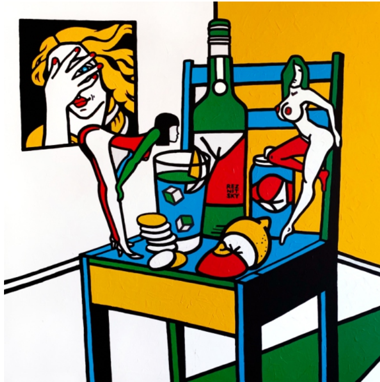
Pol_Iyamona, 2019 Acrylic on canvas 150 × 150 cm