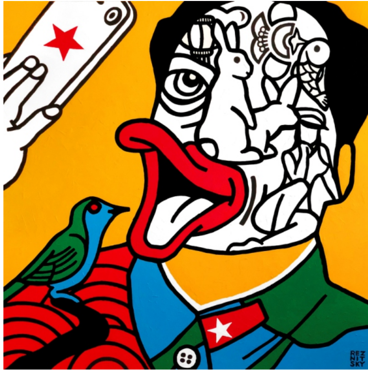
China, 2018 Acrylic on canvas 150 × 150 cm