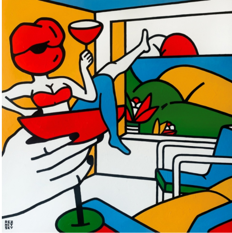
Show room, 2022 Acrylic on canvas 150 × 150 cm