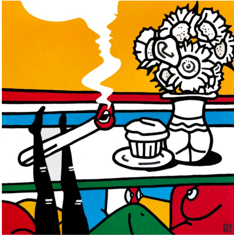
Holland, 2018 Acrylic on canvas 150 × 150 cm